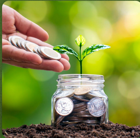
Nationally Determined Contribution