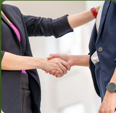
Gender Action Plan with the United Nations Framework Convention on Climate Change