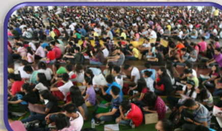
Human Capital Development