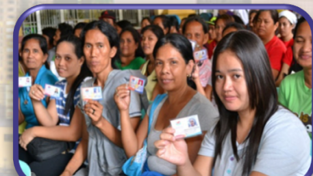
Social Protection Program