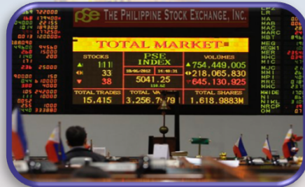
Continue macroeconomic policies