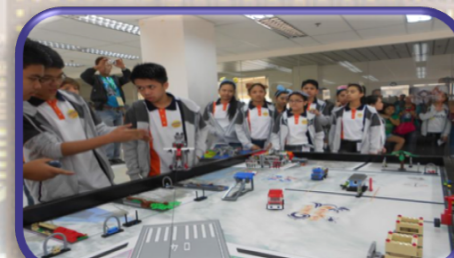
Science and Technology