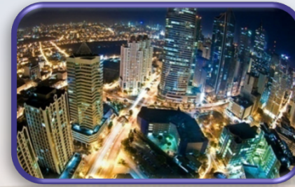
Ease of Doing Business