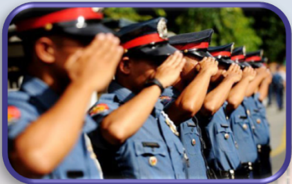
Peace and Order Stability