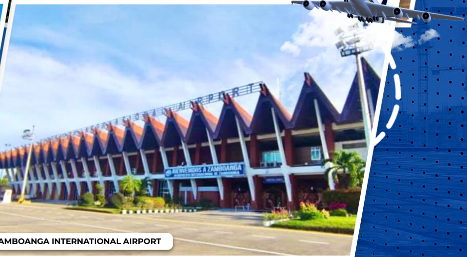
ZAMBOANGA INTERNATIONAL AIRPORT