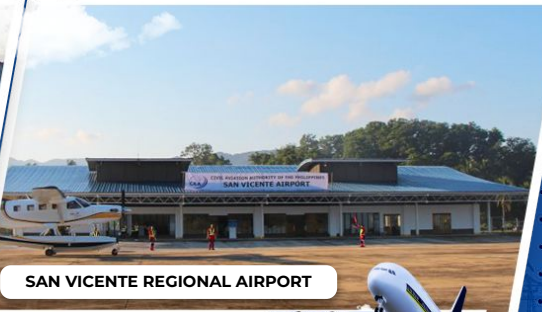
SAN VICENTE REGIONAL AIRPORT