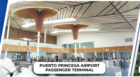
PUERTO PRINCESA AIRPORT PASSENGER TERMINAL