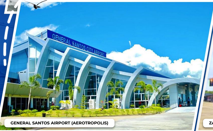
GENERAL SANTOS AIRPORT (AEROTROPOLIS)