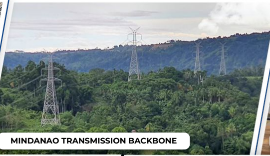
MINDANAO TRANSMISSION BACKBONE