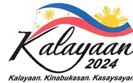
KALAYAAN 2024 OFFICIAL LOGO